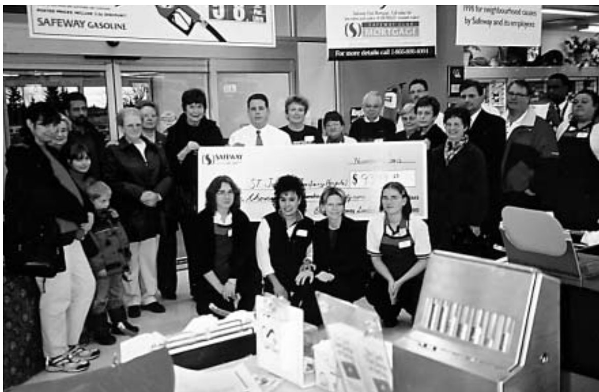
Heritage Safeway presenting St. Joseph's with a $9,349 cheque from the "Because We Care" Campaign.

site, aging equipment and furnishings need replacement. Gifts help us do this in a well-planned manner, ensuring the high priority items are available as needed. In the fiscal year 2000-2001, we received 576 donations ranging from $5 to $10,000. The size of the gift is not important, as five dollars may represent a significant financial sacrifice to many individuals. What is important, is that each dollar helps us meet the needs of the 204 people who reside at St. Joseph's Auxiliary Hospital, now and into the future.