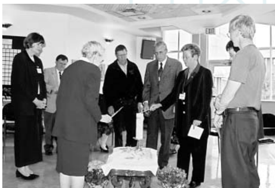
Board Members during the Fall Missioning Ceremony.

Our past inspires us. The future holds the promise that with faith, wisdom and patience we can preserve a heritage that was nobly begun and skillfully perpetuated by a visionary community of women religious - the Sisters of