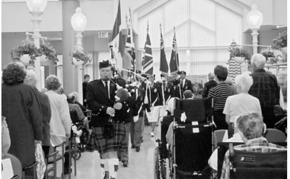
The Strathcona Royal Canadian Legion Remembrance Day Ceremony at St. Joseph's Auxiliary Hospital.

So today, as in 1927, we continue to serve our community with the compassionate, caring example of our founders as our inspiration. With our focus always on the least advantaged.