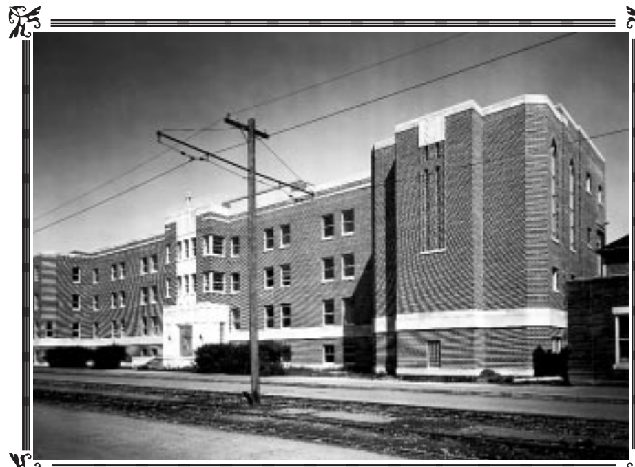
1948 Hospital with major renovations completed.