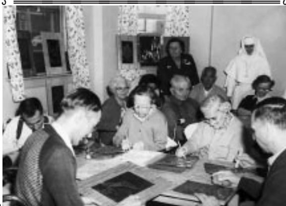
Recreation therapy 1948.