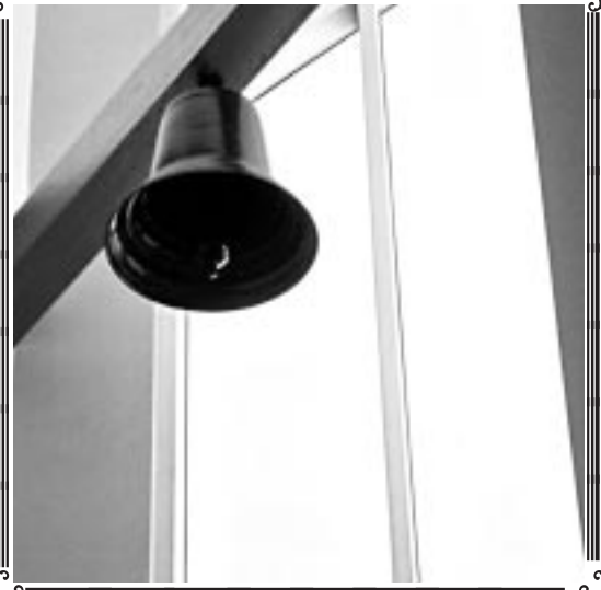
Our new chapel bell.