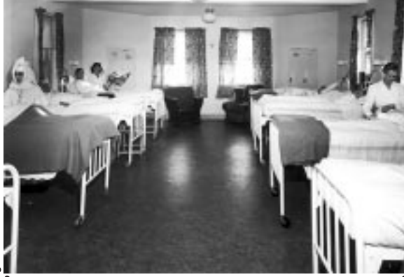
An 8-bed ward 1948.