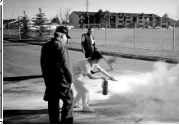
Safety Training Today.