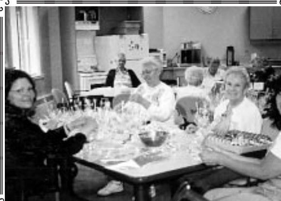
Still keeping busy 2002.