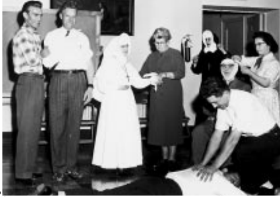
Practicing Nursing Skills 1948.

To provide quality care with compassion in the Christian tradition.