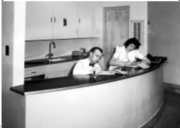
Staff at work 1948.