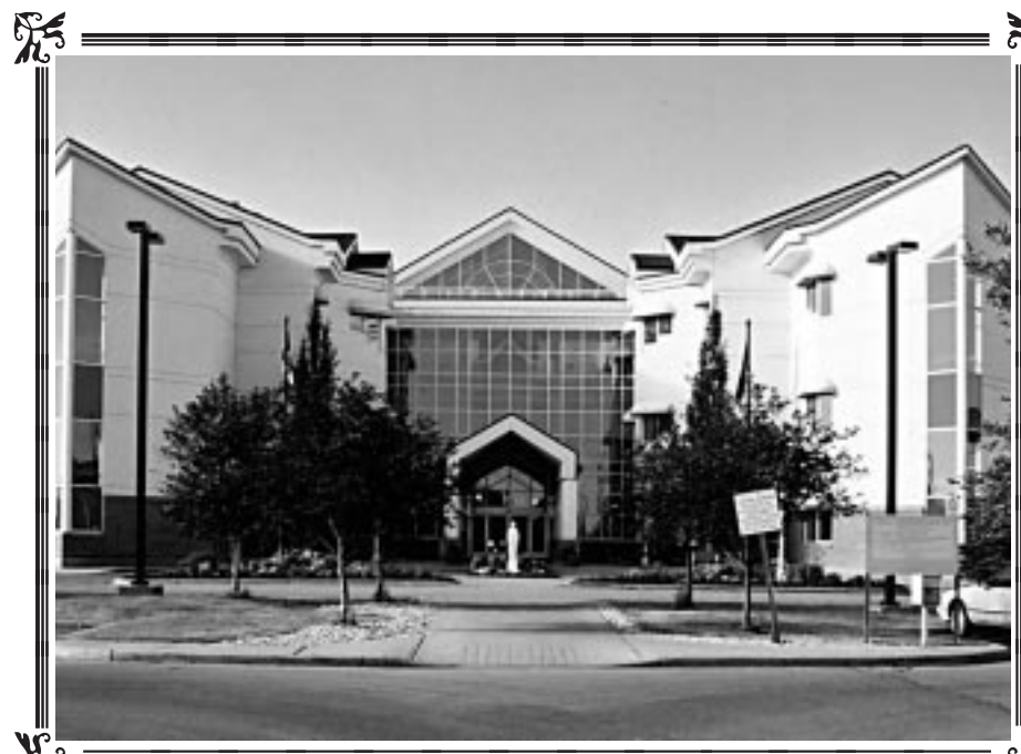
St. Joseph's today (107 Street and 29 Avenue).