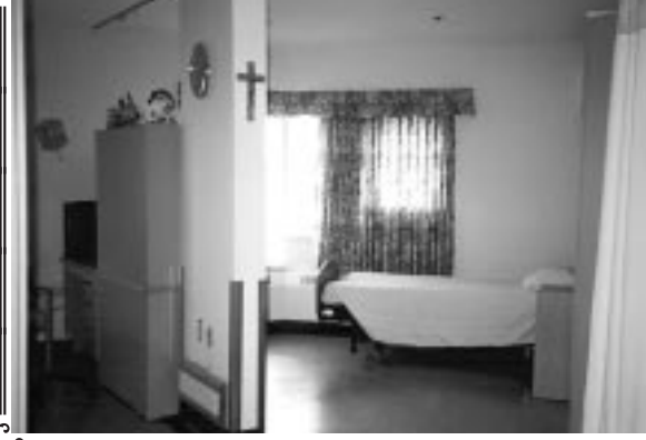
A semi-private room today.