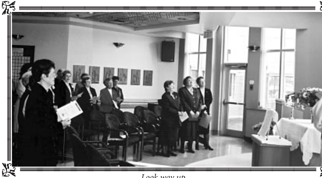
Look way up....