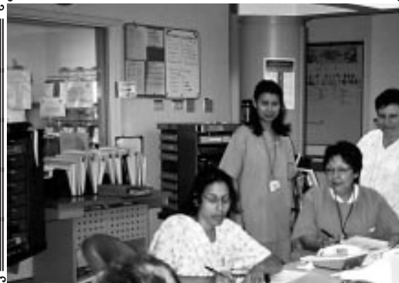
Staff at the new St. Joseph's.