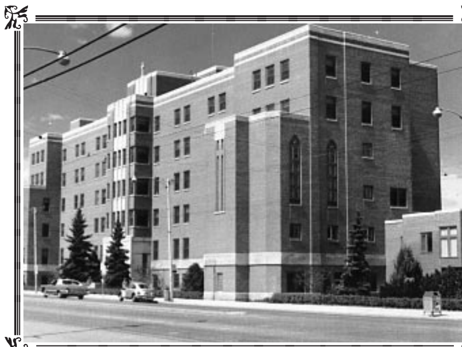
1963 Hospital with the addition of two floors, auditorium, Sister's residence and Rehabilitation areas.